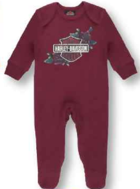
PAGE - 19