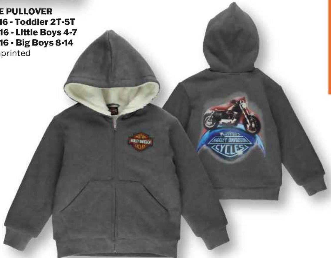
C. SHERPA LINED FLEECE JACKET 6573503 - Toddler 2T-5T 6583503 - Little Boys 4-7 6593503 - Big Boys 8-14 Screenprinted Front and Back

Price quote is based on current tariff rates and is subject to change if additional tariffs are imposed at a future date