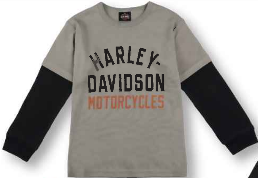
A. MOCK DOUBLER WITH THERMAL LONG SLEEVE 1074508 - Toddler 2T-5T 1084508 - Little Boys 4-7 1094508 - Big Boys 8-14 Screenprinted