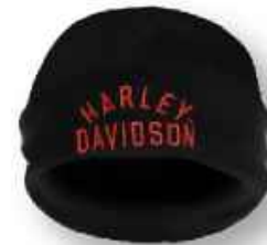
D. POLAR FLEECE BEANIE 7274502 - Toddler 2T-4T 7284502 - Kids 4-14 Embroidered