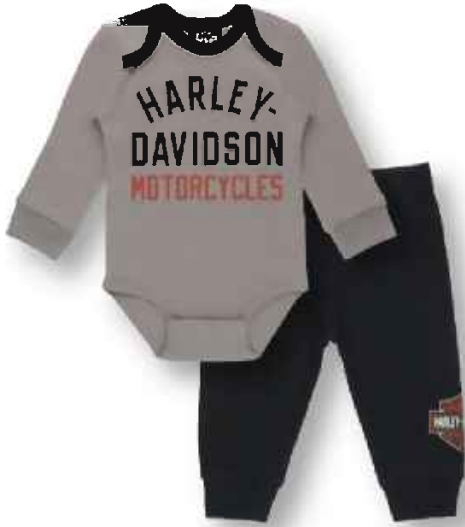
PAGE - 18