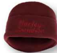
B. POLAR FLEECE BEANIE 7204506 - Newborn/Infant 6-24m Embroidered