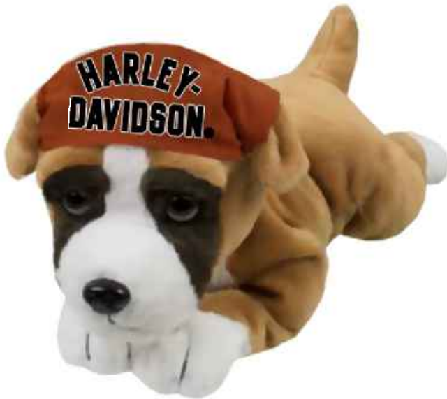
NEW! B. 'Babe the Boxer' - 14" CUDDLE BUD 9959521 - Toddler + Soft Heatseal Logo