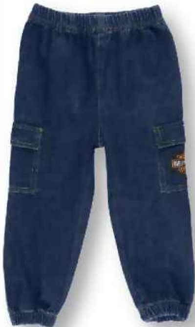
B. DENIM CARGO JOGGER 4053504 - Newborn / Infant 3-24m 4073504 - Toddler 2T-5T Appliqué Woven Patch