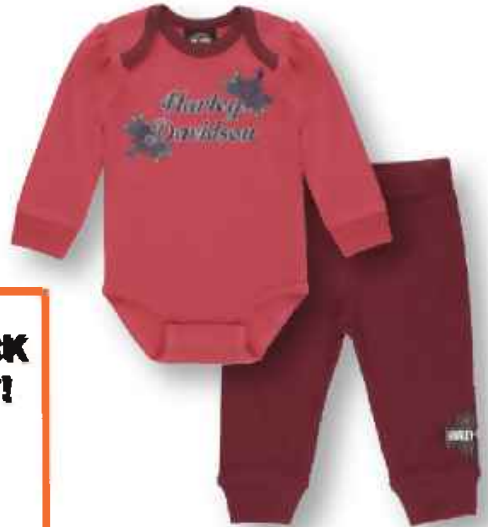
PAGE - 19