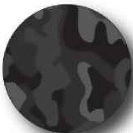
LINER FABRIC for ALL BAGS