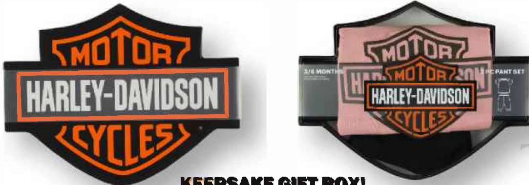
KEEPSAKE GIFT BOX!

Price quote is based on current tariff rates and is subject to change if additional tariffs are imposed at a future date.