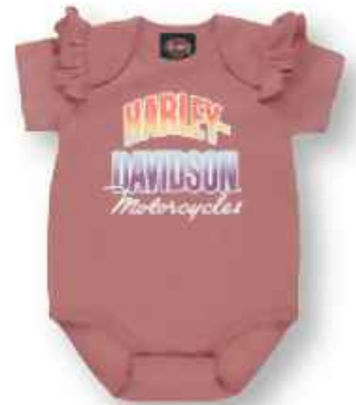
PAGE - 11