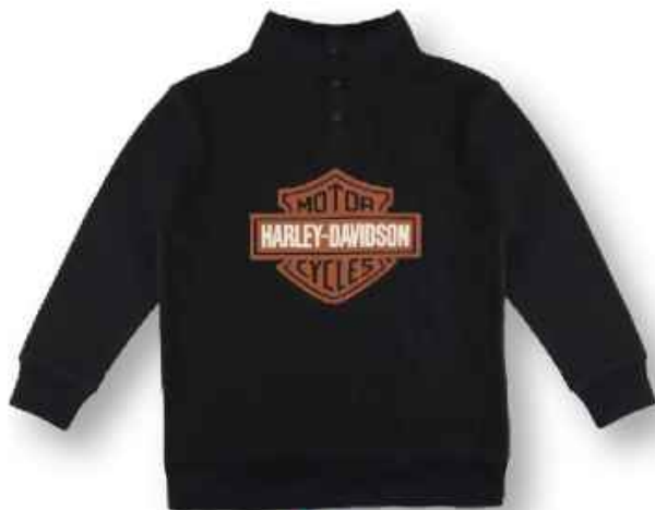
PAGE - 21