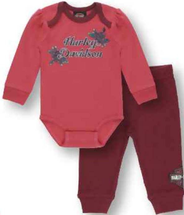
A. RIB CREEPER & THERMAL PANT SET 2504507 - Newborn 0-9m 2514507 - Infant 9-24m Screenprinted