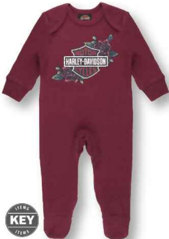
C. THERMAL FOOTED COVERALL 3004505 - Newborn/Infant 0-18m Screenprinted