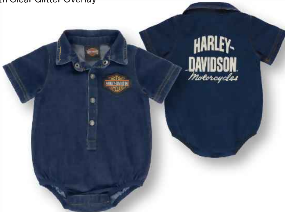
C. LIGHT WEIGHT DENIM CREEPER 3003520 - Newborn 0-9m 3013520 - Infant 9-24m Woven B&S Appliqué Patch Embroidered Back

Price quote is based on current tariff rates and is subject to change if additional tariffs are imposed at a future date