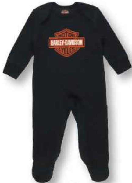
PAGE - 18