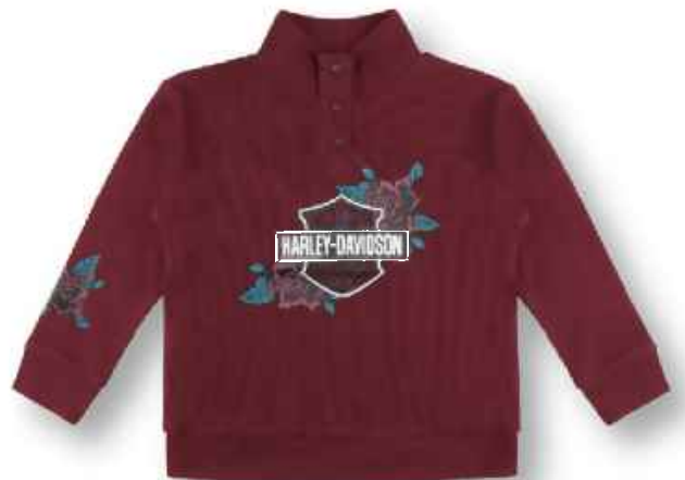
PAGE - 20