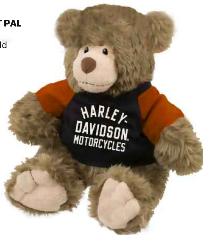
NEW! B. 'Big Ed' - 14" HUGGY BEAR 9959520 - Toddler + Soft Heatseal Logo