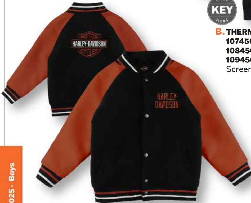
C. POLAR FLEECE / FAUX LEATHER SLEEVE QUILT LINED VARSITY BOMBER 6074510 - Toddler-Kids 2T-14 Embroidered Front & Back