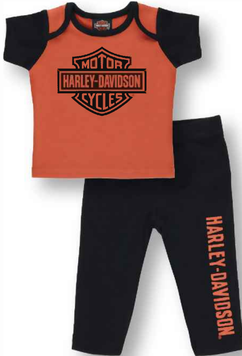
NEW! A. 2 PIECE BOXED GIFT SET 2559335 - Newborn 3/6m Screenprinted