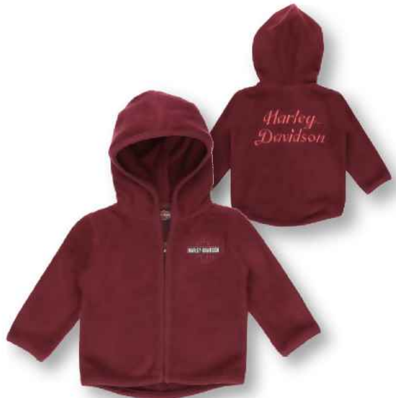
D. POLAR FLEECE HOODED JACKET 6504504 - Newborn/Infant 3-24m Appliqué Woven Patch Front Embroidered Back

Price quote is based on current tariff rates and is subject to change if additional tariffs are imposed at a future date