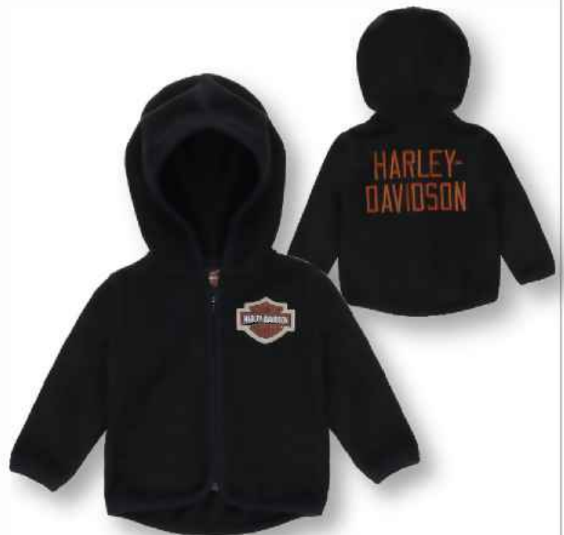
D. POLAR FLEECE HOODED JACKET 6554500 - Newborn/Infant 3-24m Appliqué Woven Patch Front Embroidered Back

Price quote is based on current tariff rates and is subject to change if additional tariffs are imposed at a future date