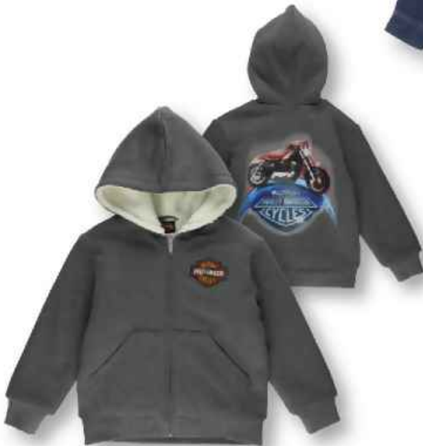
PAGE - 16