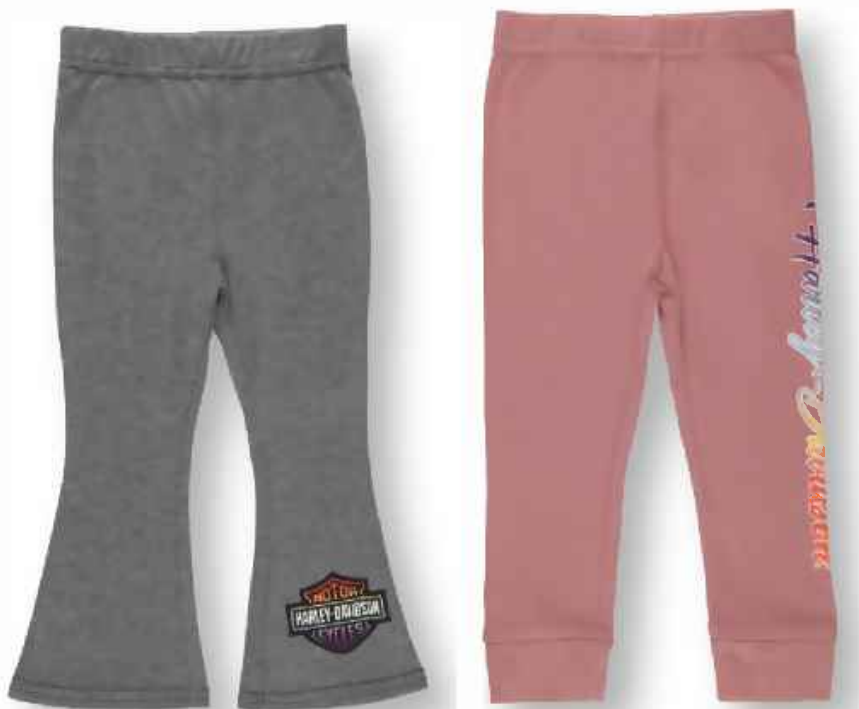
B. 2 PACK PANT SET WITH RIB LEGGING / KNIT FLARE 4003509-Newborn / Infant 3-24m 4023509-Toddler 2T-5T Glitter Screenprint

Price quote is based on current tariff rates and is subject to change if additional tariffs are imposed at a future date