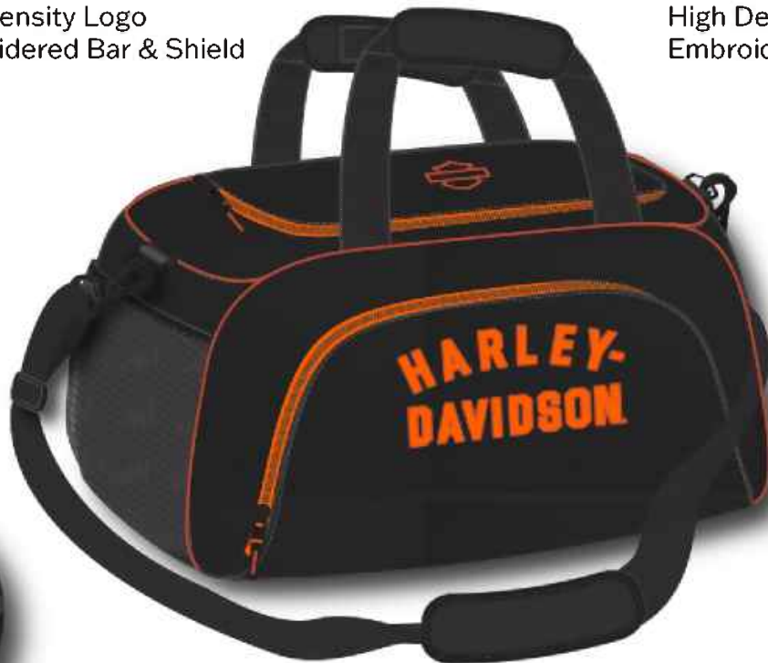
NEW! B. LUNCH TOTE (5"d x 9"w x 7"h) 7189571 High Density Logo Embroidered Bar & Shield