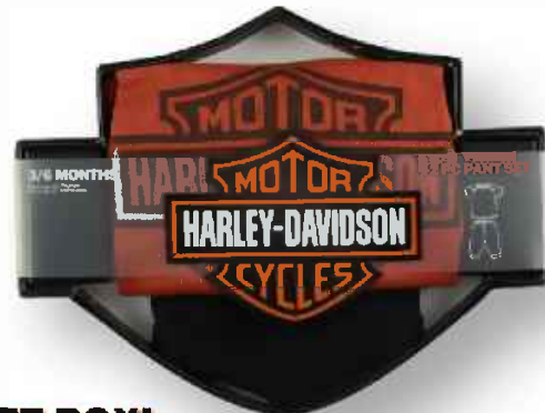
KEEPSAKE GIFT BOX!