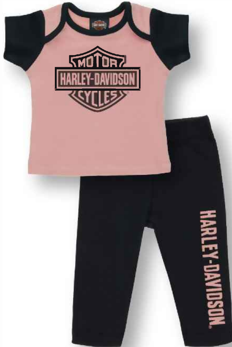
NEW! A. 2 PIECE BOXED GIFT SET 2509334 · Newborn 3/6m Screenprinted