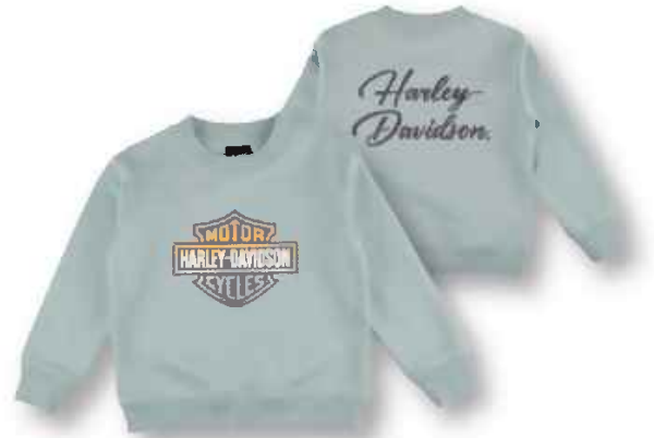
PAGES - 12 & 14