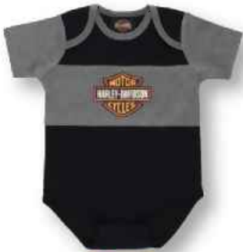
PAGE - 9