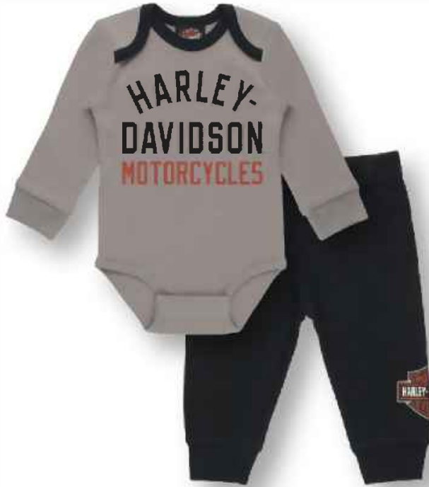
A. RIB CREEPER & THERMAL PANT SET 2554503 - Newborn 0-9m 2564503 - Infant 9-24m Screenprinted