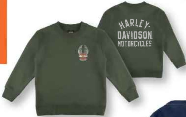
PAGES - 10 & 16