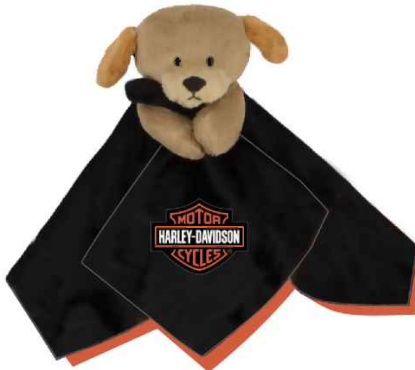
NEW! A. 'Cuddles' - 16" BLANKET PAL 9959524 - Infant + Soft Heatseal Bar & Shield