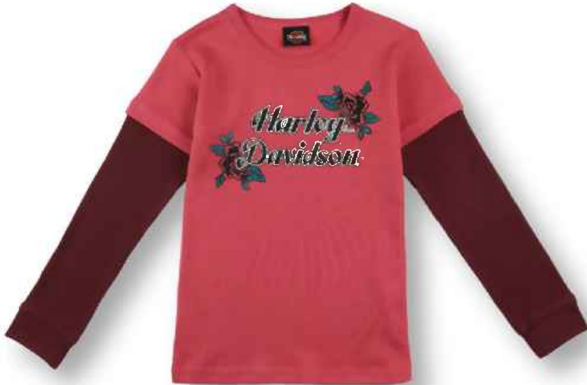
A. MOCK DOUBLER WITH THERMAL LONG SLEEVE 1024511 • Toddler 2T-5T 1034511 • Little Girls 4-6x 1044511 • Big Girls 7-12 Screenprinted