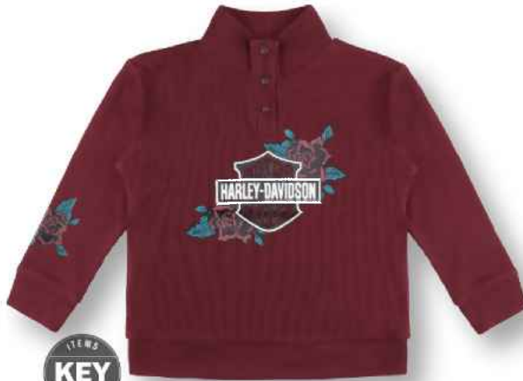
C. THERMAL SNAP PLACKET PULLOVER 1024512 • Toddler 2T-5T 1034512 • Little Girls 4-6x 1044512 • Big Girls 7-12 Screenprinted