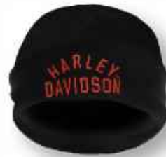
B. POLAR FLEECE BEANIE 7254502 - Newborn/Infant 6-24m Embroidered