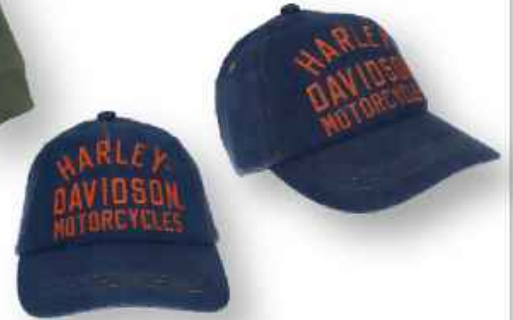
B. DENIM BASEBALL CAP 7273536 - Toddler 2T-5T 7283536 - Boys 4-14 Screenprint