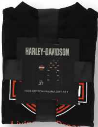
B. COTTON RIB TIGHT FIT PAJAMA GIFT SET 8023531 - Toddler Girls (2T-3T-4T) 8033531 - Little Girls (4-5-6-7-8-10) Screenprinted Top with Allover Print Pant