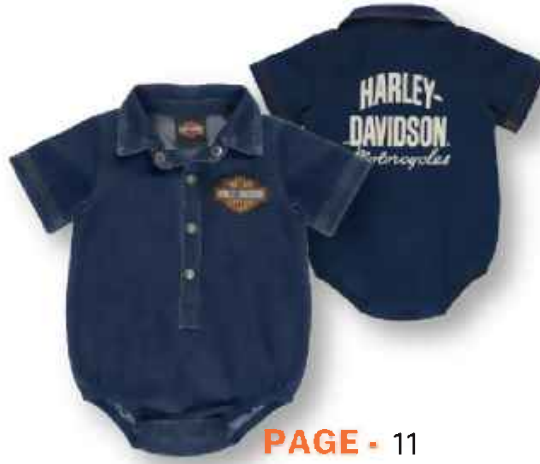
PAGE - 11