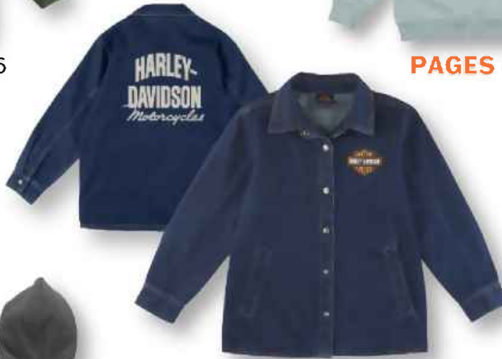
PAGE - 13