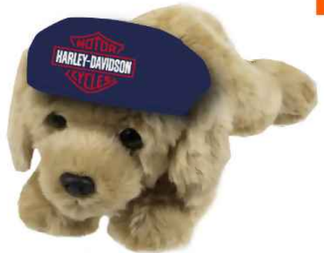
NEW! C. 'Freedom the Retriever' - 14" CUDDLE BUD 9959522 - Toddler + Soft Heatseal Bar & Shield

Price quote is based on current tariff rates and is subject to change if additional tariffs are imposed at a future date.