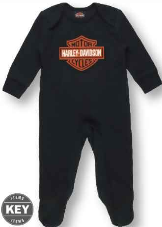
C. THERMAL FOOTED COVERALL 3054501 - Newborn/Infant 0-18m Screenprinted