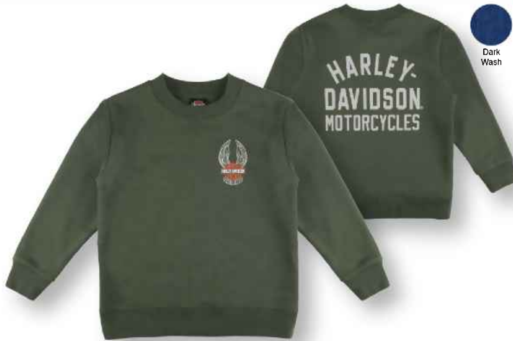
A. FLEECE PULLOVER 6553516 - Newborn / Infant 3-24m Screenprinted Front and Back