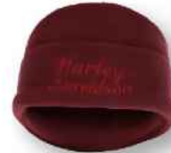
B. POLAR FLEECE BEANIE 7224506 • Toddler 2T-4T 7234506 • Kids 4-14 Embroidered