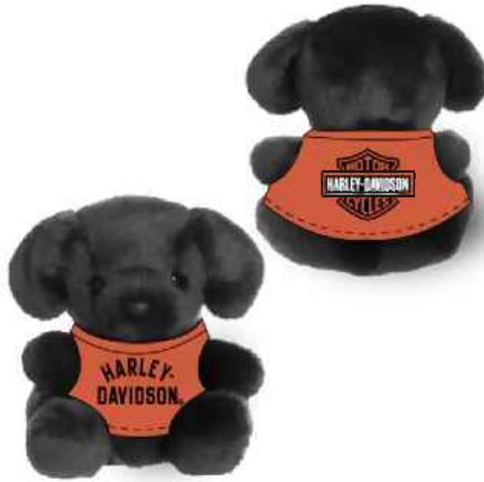
NEW! A. 'Bean' - 5" BEANIE BAG SOOTHIE 9959523 - Toddler + Soft Heatseal Bar & Shield / Logo