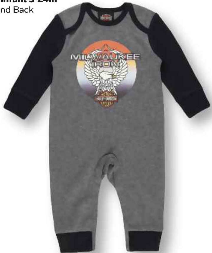
C. KNIT COVERALL 3053501 - Newborn / Infant 0-18m Screenprinted