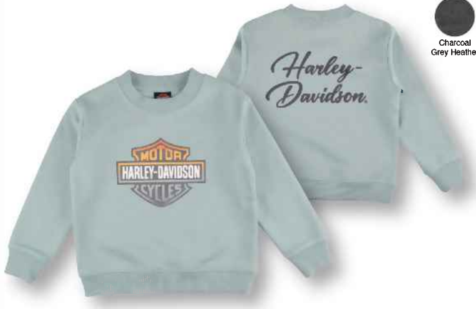
A. FLEECE PULLOVER 6503512-Newborn / Infant 3-24m Glitter Screenprint