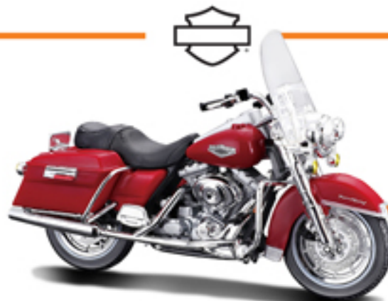
1999 FLHR Road King ®