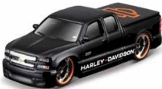
2004 Chevrolet® Silverado™ SS™