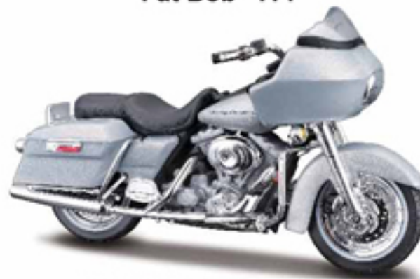
2002 FLTR Road Glide ®