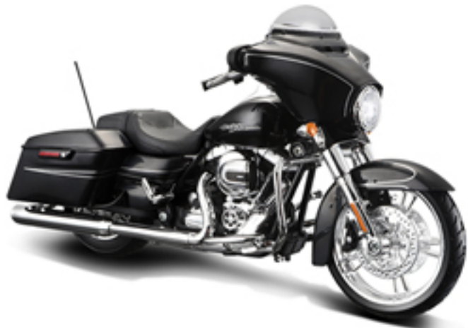
2015 Street Glide® Special