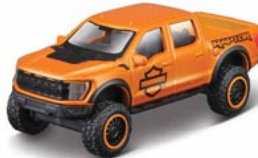
2021 Ford Raptor