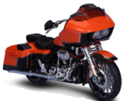
2022 CVO ™ Road Glide ®