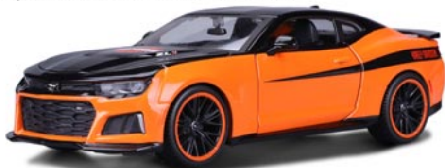
#32271 2017 Chevrolet Camaro® ZL1™