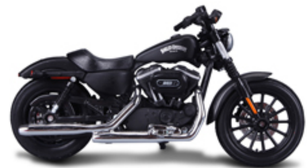
2014 Sportster ® Iron 883™