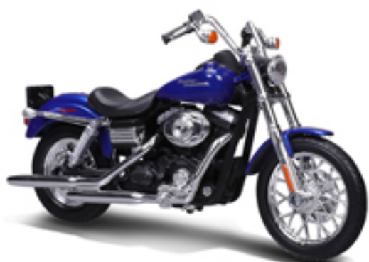
2006 Dyna ® Street Bob ®