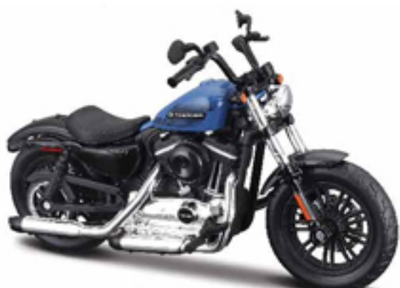
2022 Forty-Eight ® Special