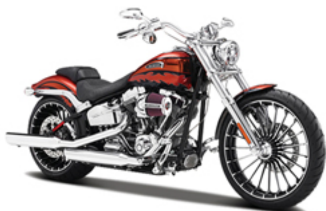
2014 CVO™ Breakout®