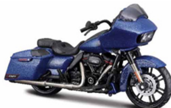
2022 CVO ™ Road Glide ®