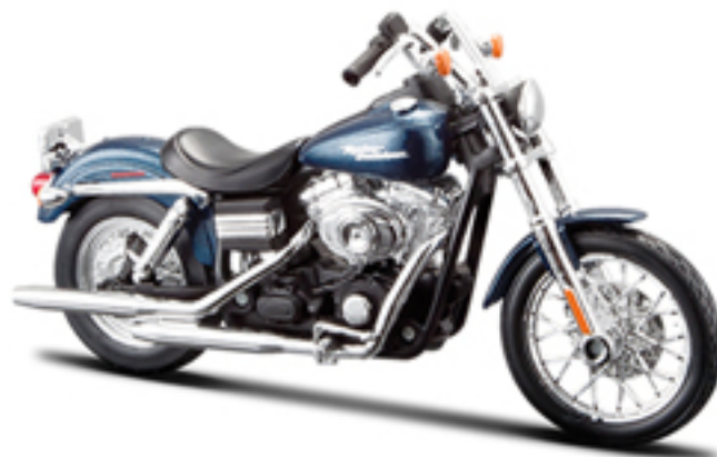
2006 FXDBI Dyna® Street Bob®