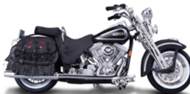
1999 FLSTS Heritage Springer™