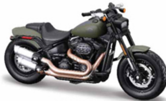
Fat Bob ® 114