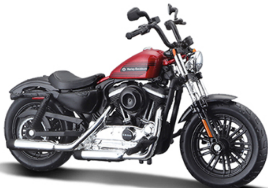
2014 Sportster® Iron 883™