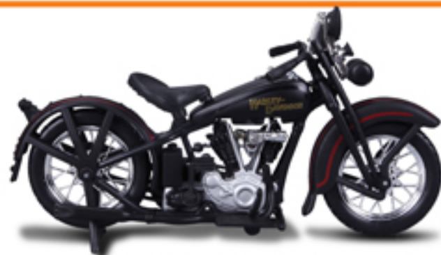
1928 JDH Twin Cam™