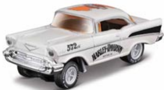
1957 Chevy® Bel Air®