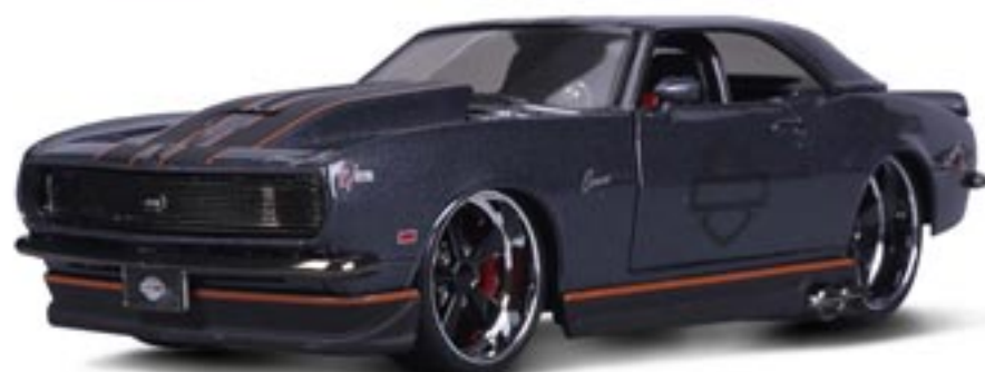
#32273 1968 Chevrolet Camaro®