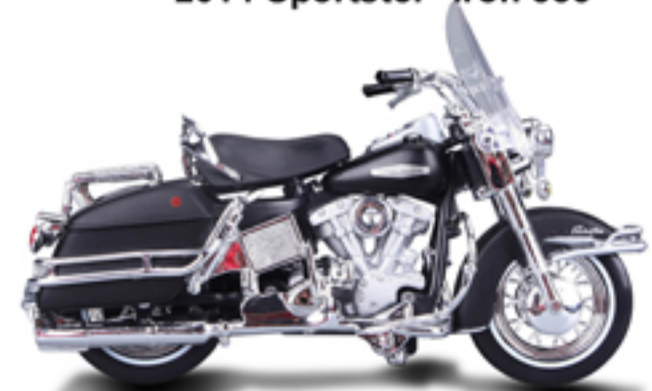
1966 FLH Electra Glide ®