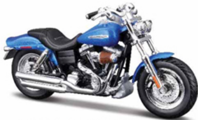
2009 FXDFSE CVO™ Fat Bob ®