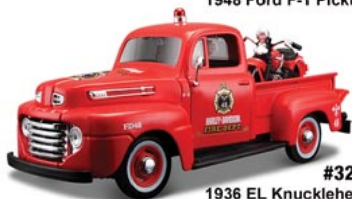
#32191 1936 EL Knucklehead + 1948 Ford F-1 Pickup