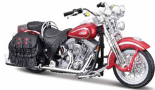
1999 FLSTS Heritage Springer™