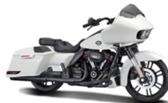
2018 CVO™ Road Glide ®