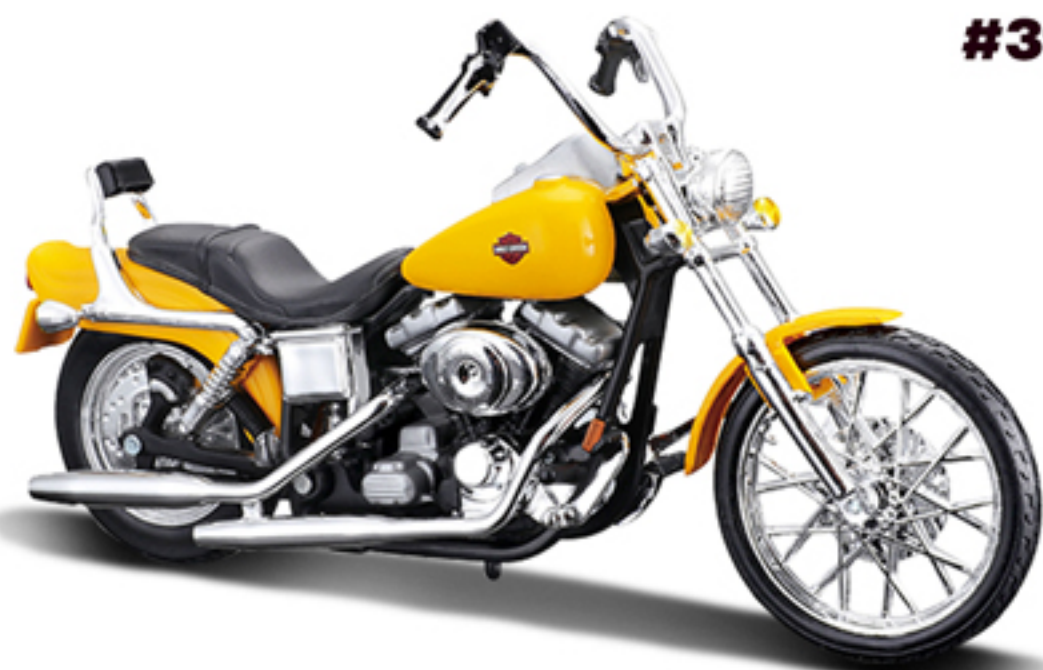
2001 FXDWG Dyna® Wide Glide®