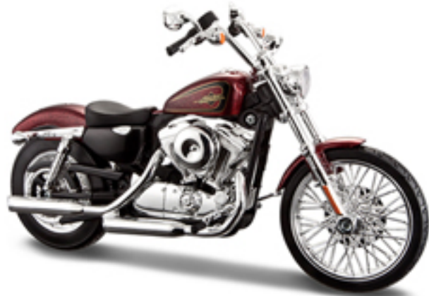
2012 XL 1200V Seventy-Two®