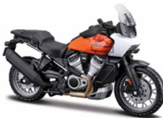
2021 Pan America ® 1250