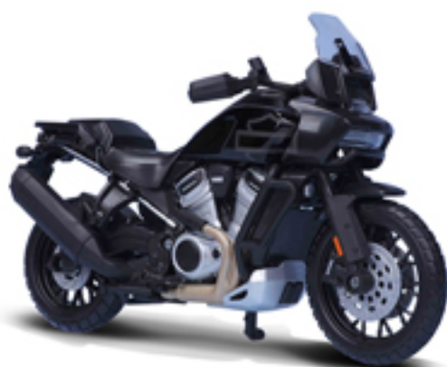
2023 Pan America ® 1250 Special