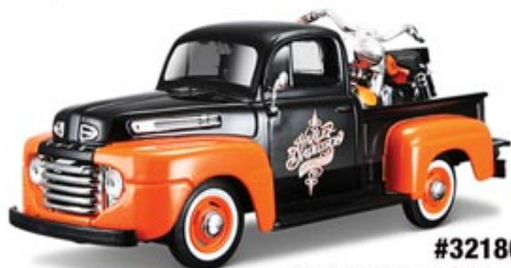
#32180 1958 FLH Duo Glide + 1948 Ford F-1 Pickup