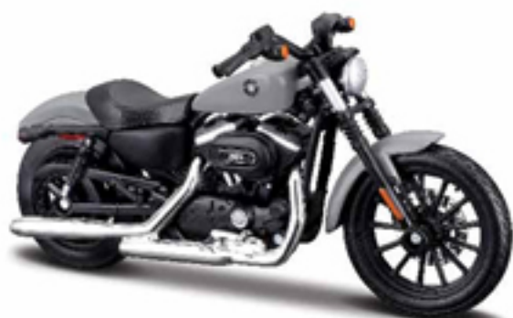
2022 Sportster ® Iron 883 ™