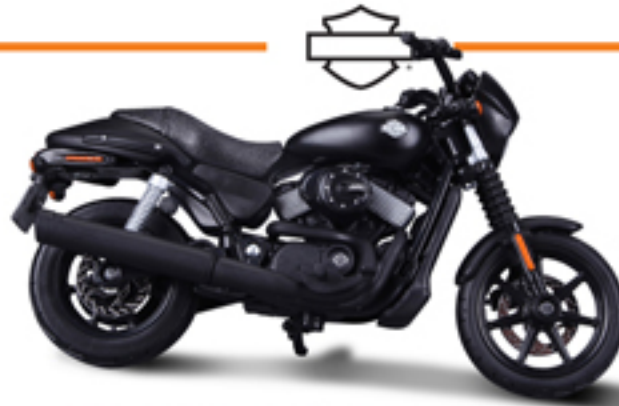
2015 Harley-Davidson Street ® 750