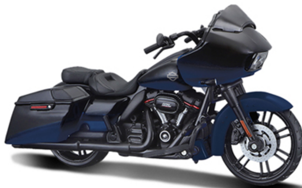
2018 CVO™ Road Glide®