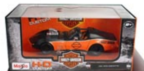
#32160 Asst. Full-Color Window Box, Asst.