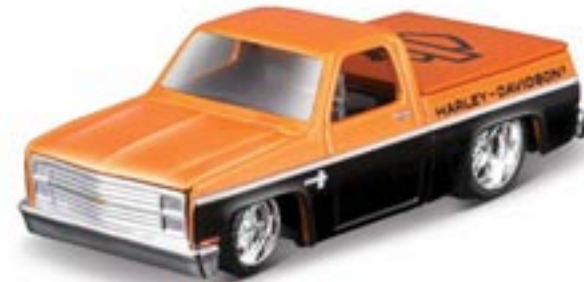
1987 Chevy® 1500