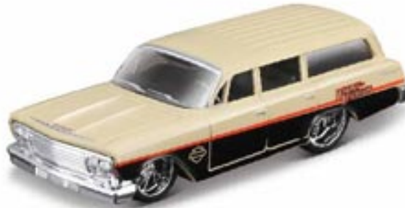
1962 Chevrolet® Biscayne™ Wagon