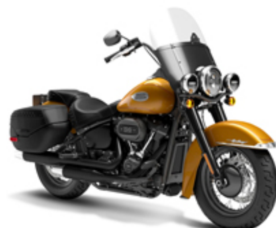
2023 Heritage Classic