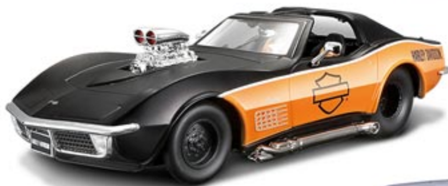
#32193 1970 Corvette®