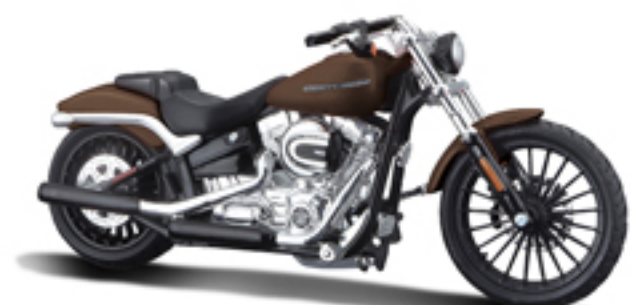
2016 Breakout ®