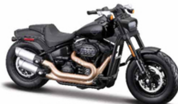
2022 Fat Bob ® 114