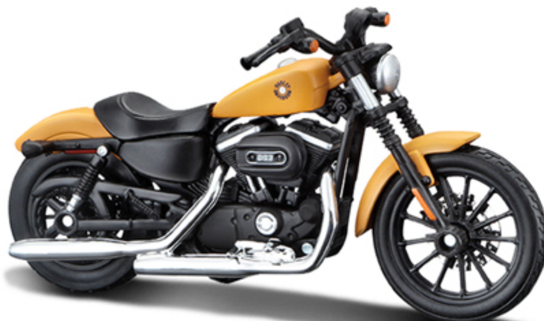
2018 Forty-Eight® Special