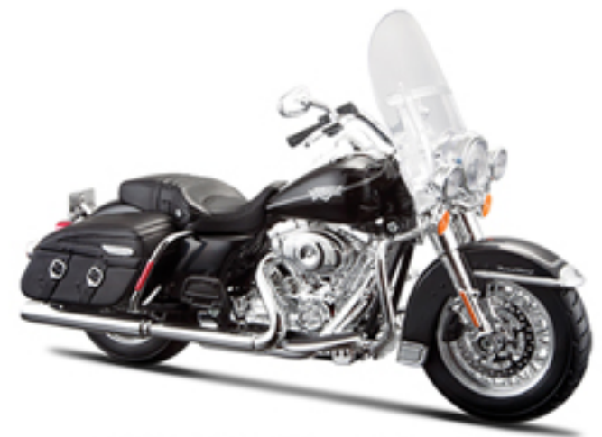
2013 FLHRC Road King® Classic