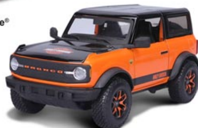
#32272 Ford Bronco Badlands