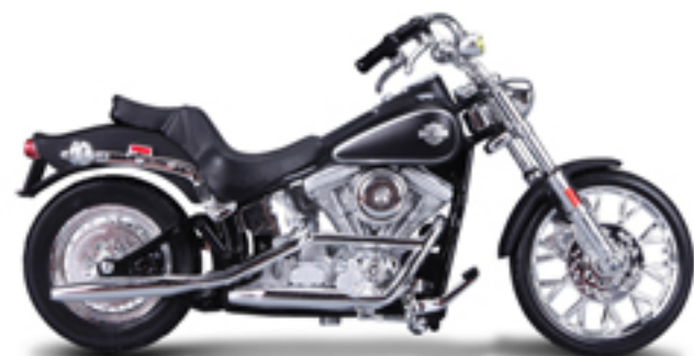
1984 FXST Softail ®