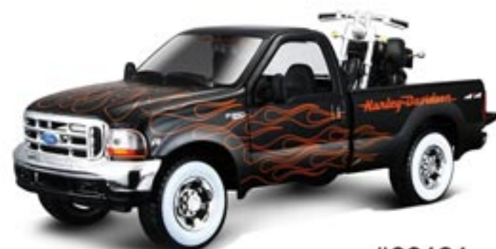
#32181 2002 FXSTB Night Train™ + 1999 Ford F-350 Super Pickup