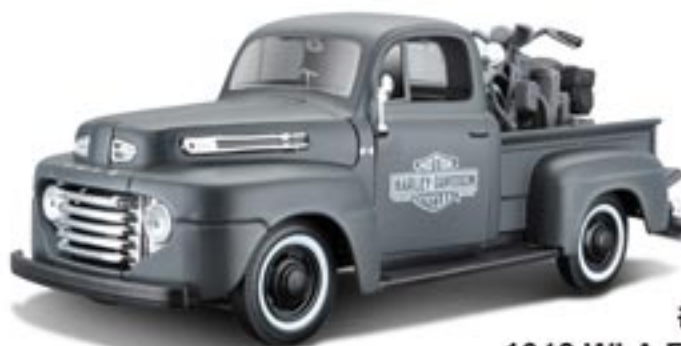
#32185 1942 WLA Flathead + 1948 Ford F-1 Pickup