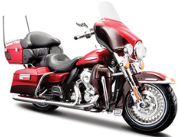
2013 FLHTK Electra Glide® Ultra Limited®