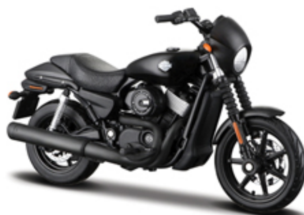
2015 Harley-Davidson Street® 750