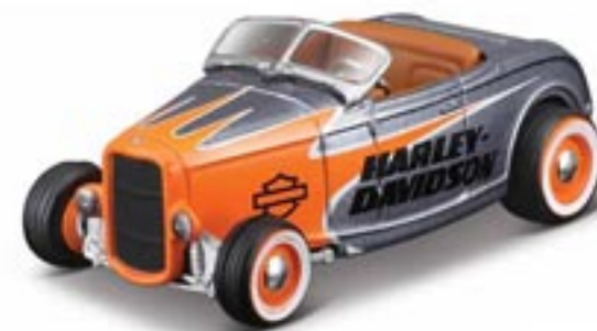
1932 Ford Roadster

New Designs for the hardworking Harley-Davidson™ Haulers will be included in the assortment which features opening front hinged hood, detailed engine, opening rear door, and detailed interior.