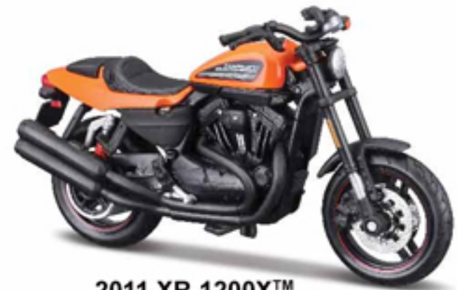
2011 XR 1200X™