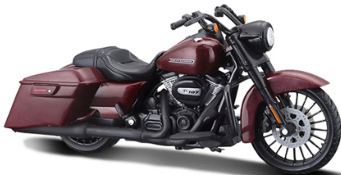
2017 Road King® Special