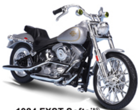
1984 FXST Softail ®