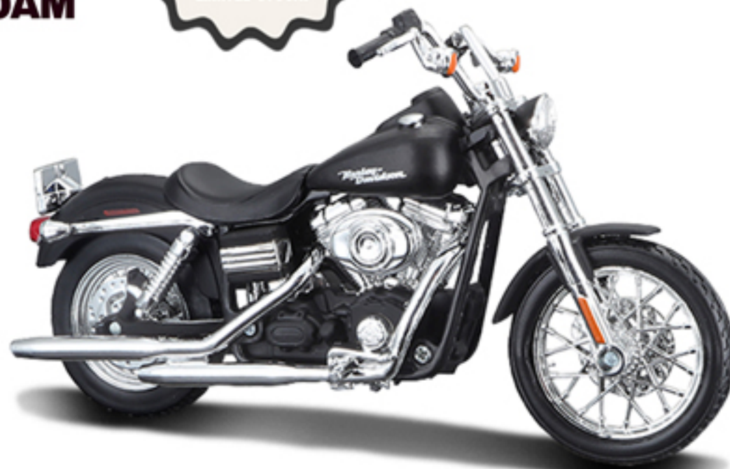
2006 Dyna® Street Bob®