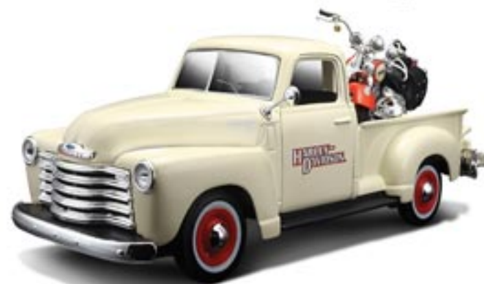
#32194 2001 FLSTS Heritage Springer™ + 1950 Chevrolet® 3100™ Pickup