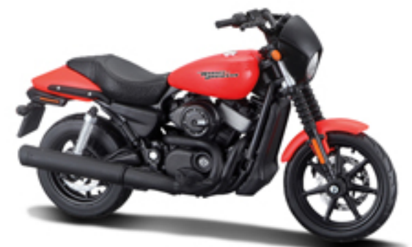
2015 Harley-Davidson Street ® 750