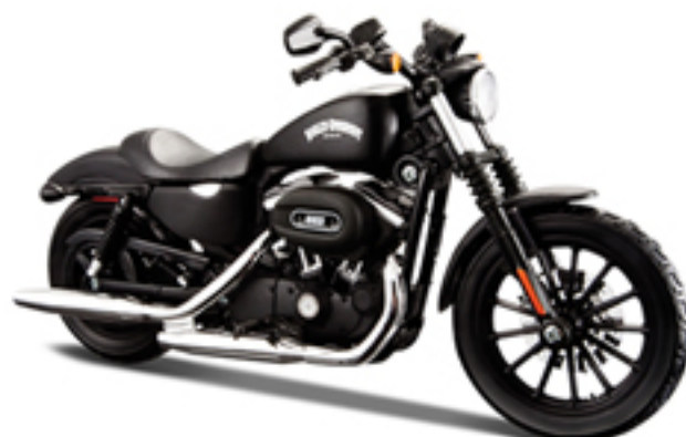
2014 Sportster® Iron 883™