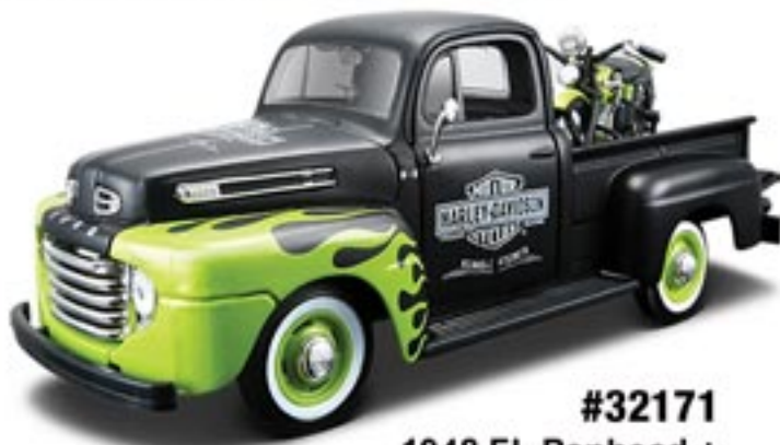
#32171 1948 FL Panhead + 1948 Ford F-1 Pickup