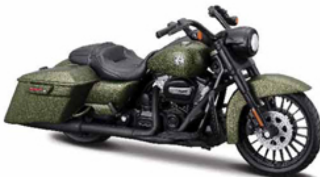
2022 Road King ® Special