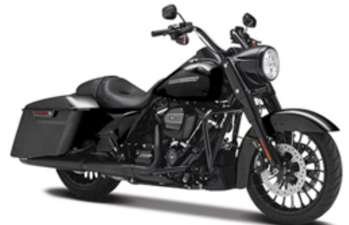
2017 Road King® Special