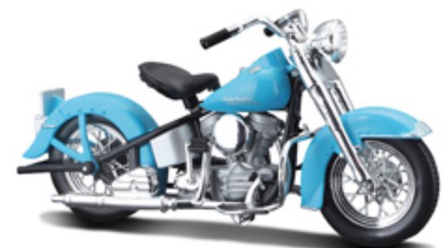
1953 FL Hydra Glide