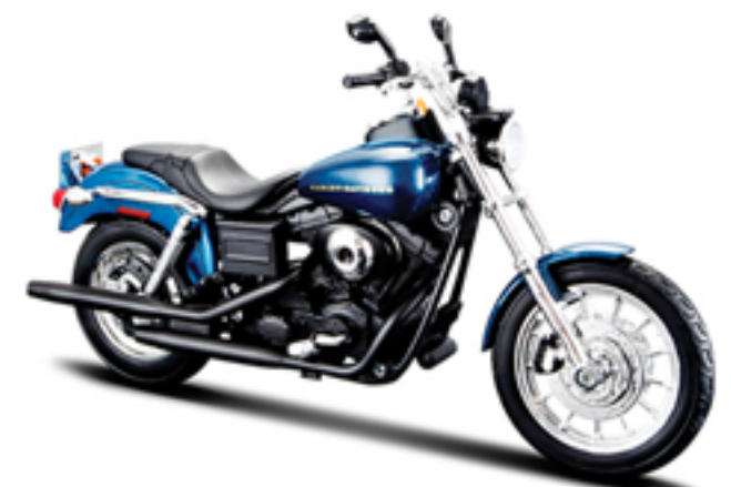
2004 Dyna® Super Glide® Sport