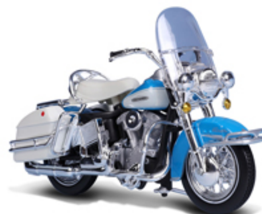
1966 FLH Electra Glide ®