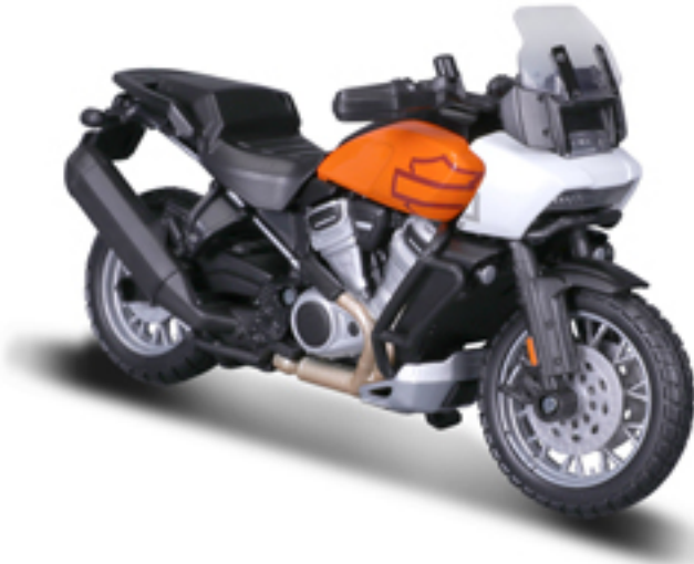
2021 Pan America® 1250 Special